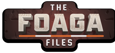
FOAGA TABLE 2