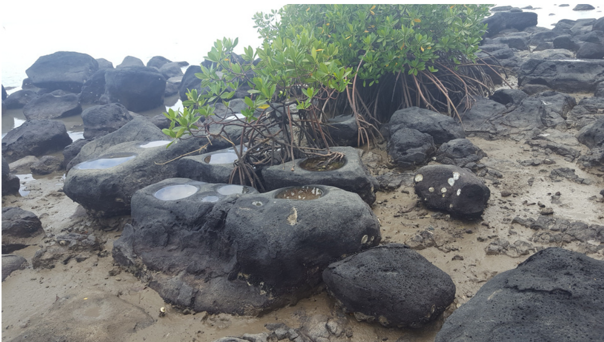
Grouping of foaga documented at Fagapalapala beach, Tuana'i.