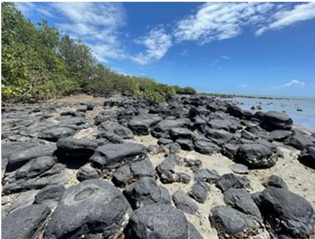
Western end of Fagapalapala Beach, Tuana'i village, Upolu.

The village informed us that there are many other foaga hidden amongst the mangrove swamp and further out in the ocean. We were not able to document them at this time because of availability of access and limited survey time. This is a site that needs to be revisited in future to re-find and document all of the remaining foaga.