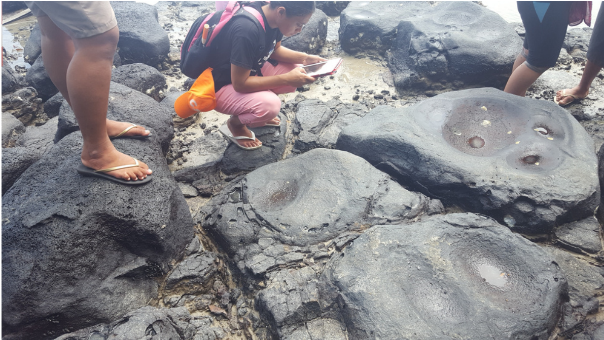
Saleaumua Vili recording the Tuana'i Foaga 1 found during site visit.