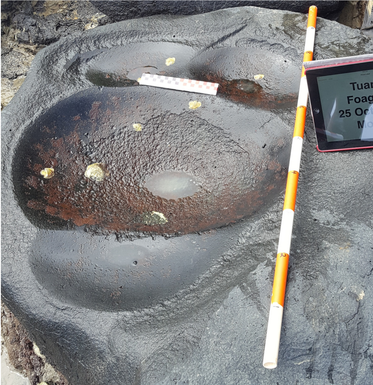
Tuana'i Foaga 1, a unique multi-faceted foaga, with photoscale and ruler.