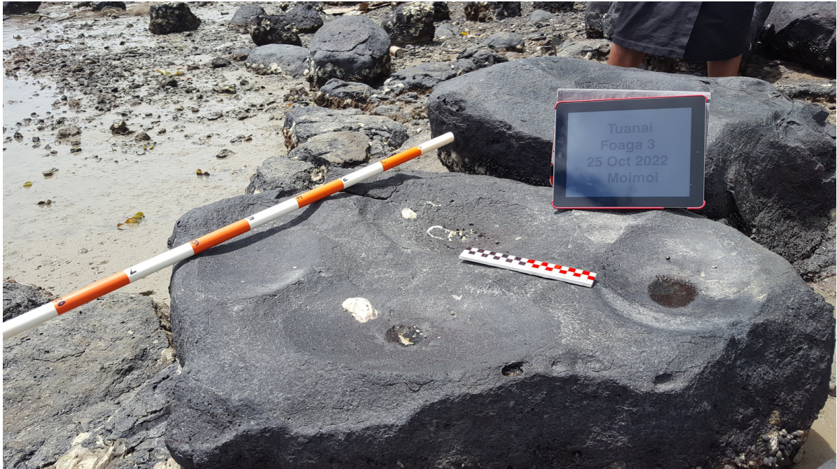
Tuana'i Foaga 3 with photoscale and ruler.