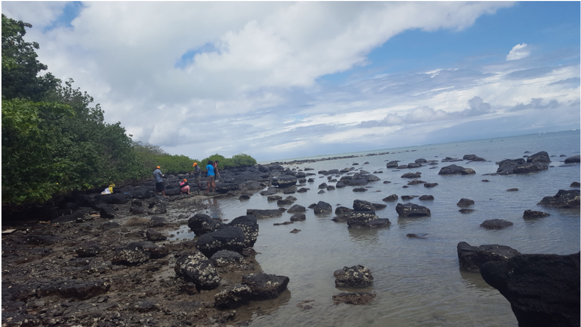
Western end of Tuana'i survey.